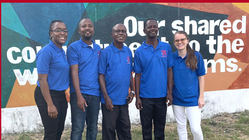
OUR INGENIOUS TRAINING TEAM

We fully understood the magnitude of impact this training would have in the lives of thousands of teachers, and even more students, so failing was never an option.